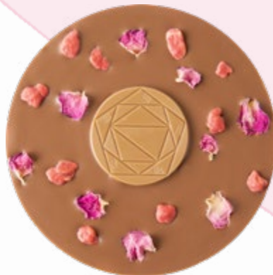
ROCK 'N' ROSES Art. No. 24176 Milk Choco + Praline + Almonds + Roses

A sweet chocolate ballad: one sweet milk chocolate disc with a smaller, tender-melting almond praline disc sitting in the middle. Decorated all over with fragrant, pink rose petals and roasted almonds and covered with a fruity raspberry couverture and a touch of rose oil. The stunning pink colour is derived entirely naturally from raspberries alone.