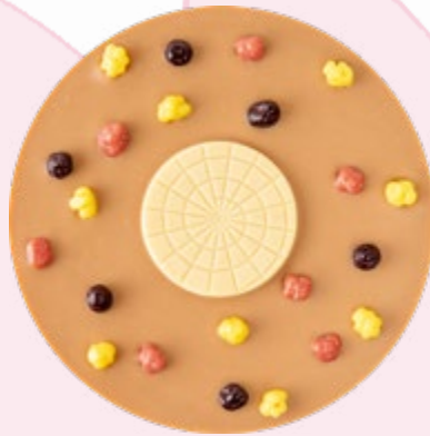
RAINBOW Art. No. 24177 Milk Choco + White Choco + Crunchy Fruit

Sweet & colourful, just like life itself: one disc made of milk chocolate and a smaller one made of sweet white chocolate. Decorated brightly all over with crunchy, chocolatey fruit: crispy strawberries in a pink strawberry couverture, passion fruit in a sunny, yellow passion fruit couverture and blueberries in a purple blueberry couverture, all of their stunning colours derived entirely naturally from berries and other fruit.