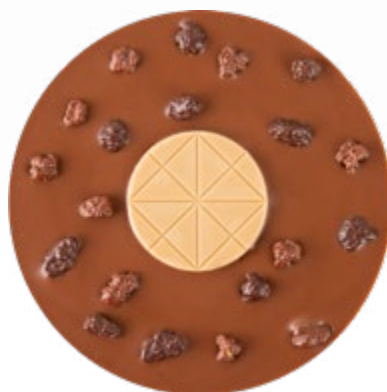
TOTALLY NUTS Art. No. 24130 Hazelnut Praline + Cashew Praline + Nuts

Nuts – crunchy & tender-melting: a nutty disc, created with a mix of hazelnut praline and milk chocolate, combined with a smaller cashew praline disc. The two types of praline are made directly at our chocolate factory using freshly roasted nuts. Decorated all over with crunchy hazelnuts dunked in dark chocolate and walnuts coated in milk chocolate.